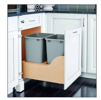
For 4WCSC Bottom Mounts

No Door Hardware needed! The perfect mechanical solution for handle free waste container pull outs is now available in a kit for all standard depth waste containers. Simply add mechanism to concealed slides to allow easy fingertip opening.