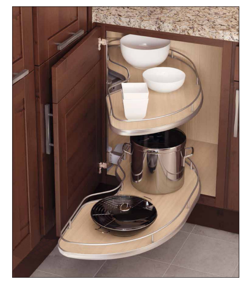
Right Hand unit shown