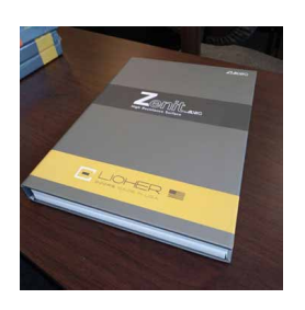
ZENIT-BK Net $ 22 Sample Book that includes Zenit Super Matte chips.