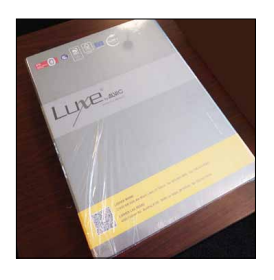
LUXE-BK Net $ 40 Sample Book that includes Luxe High Gloss chips.