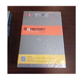
SYNCRON-BK Net $ 35 SYNCRON-REG-BK Net $ 33

Sample Books that include Syncron textured chips.